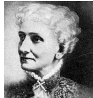
Mary Baker Eddy

Eddy twists Scripture to ostensibly prove her depiction of God as impersonal and unitarian ("divine Principle") and of humanity as sinless but deceived (asleep in an "Adam dream"). She claims to have discerned rules and examples in the Bible by which the individual can wake himself from dreaming and begin exercising the dominion granted mankind in Genesis 1.