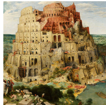
Tower of Babel (Breugel)

The same utopian illusion of human perfectibility in an imperfect world that anciently lured Adam and Eve to eat of the forbidden tree, and later enticed the builders of Babel to erect a tower to heaven, operates today in the hubris of progressive politics and scientism, the seductions of hard and soft Marxism, and the subjectivity of liberal theology in its many guises, Christian Science included.