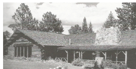
The Lodge at Camp

Right there at the Colorado camp, my family’s own camp, where so much of my spiritual formation