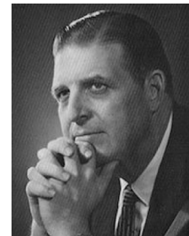
Carl F. H. Henry

Then I attend a week of lectures by Carl F. H. Henry at Denver Seminary; an odd place for the local Christian Science first reader to turn up. The eminent theologian's quiet intensity arrests me. There is something humbly holy about him; disturbing yet irresistible.